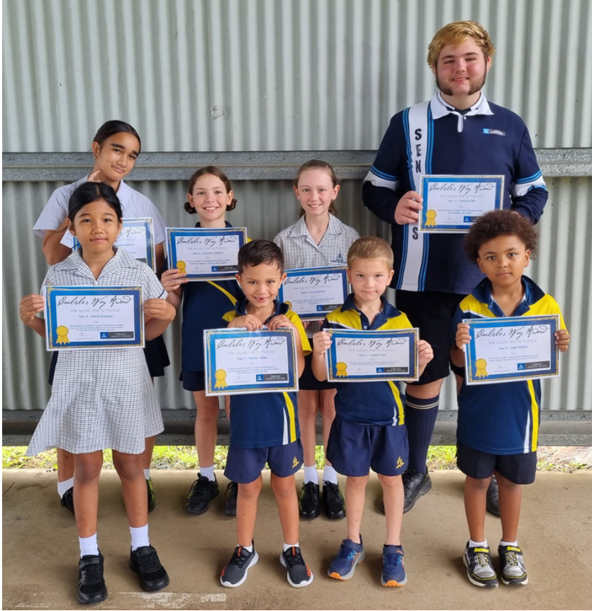
Every week we celebrate one of our CARE values. Here are the recipients of the Carlisle's Way Award for Week 5