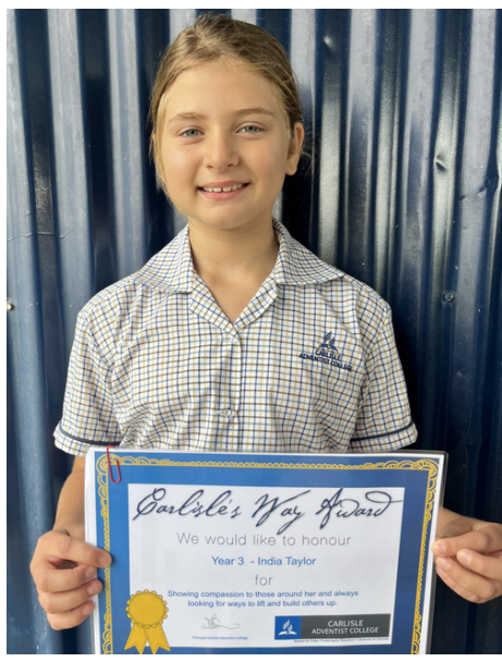
India T: For showing compassion to those around her and always looking for ways to lift and build others up.