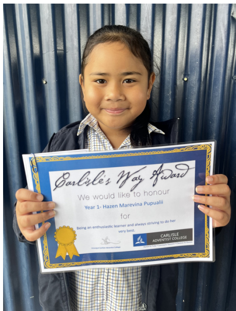
Hazen P: For being an enthusiastic learner and always striving to do her best.