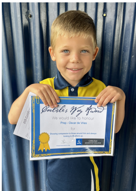
Oscar D: For showing compassion to those around him and always looking to lift others up.